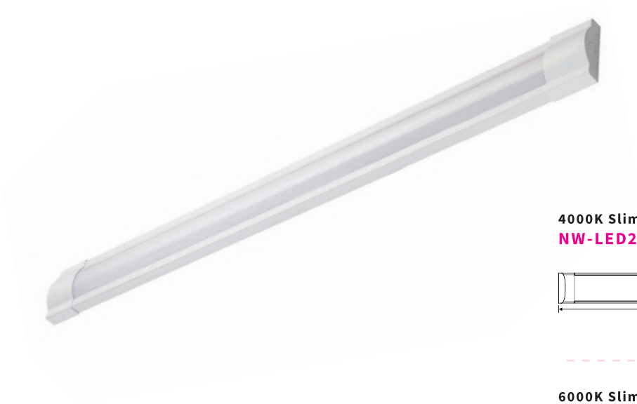
4000K Slimline Batten NW-LED220-YPC