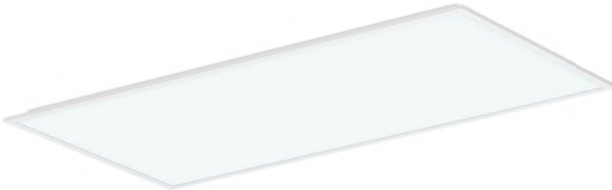
60W 600x1200 Panel Light PL-HCT60120