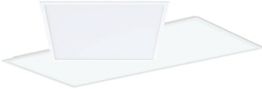
36W 600x600 Panel Light NW-6060BL