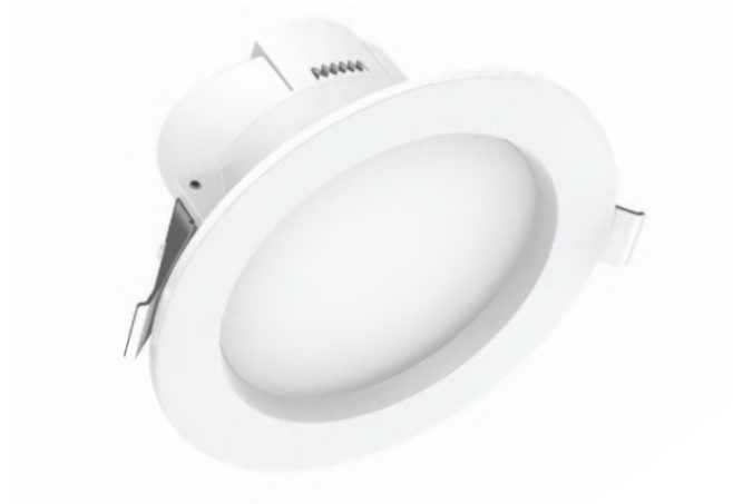
10W ECO Downlight Recessed Diffuser PLER10WD